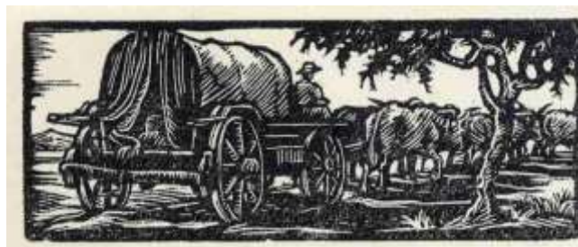
From A.0017, Item no.9